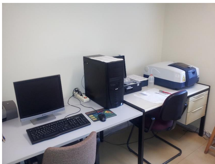
Jasco 4200 Type A FTIR spectrophotometer

FTIR measurements were carried out using a Fourier Transform IR spectrophotometer (Jasco 4200 Type A). The FTIR spectra, in the wavenumber range from 400 to 4000 \text{cm}^{-1} and resolution 4 \text{cm}^{-1} , were obtained by the KBr pellet technique. The pellets were prepared by pressing a mixture of the sample and dried KBr (sample: KBr approximately 1:200) at 7.5 \text{t/cm}^2 . The evaluation of FTIR spectra was carried out by the use of Jasco Spectra Manager™ Suite software. The Figure 4 shows Jasco 4200 Type A spectrophotometer.